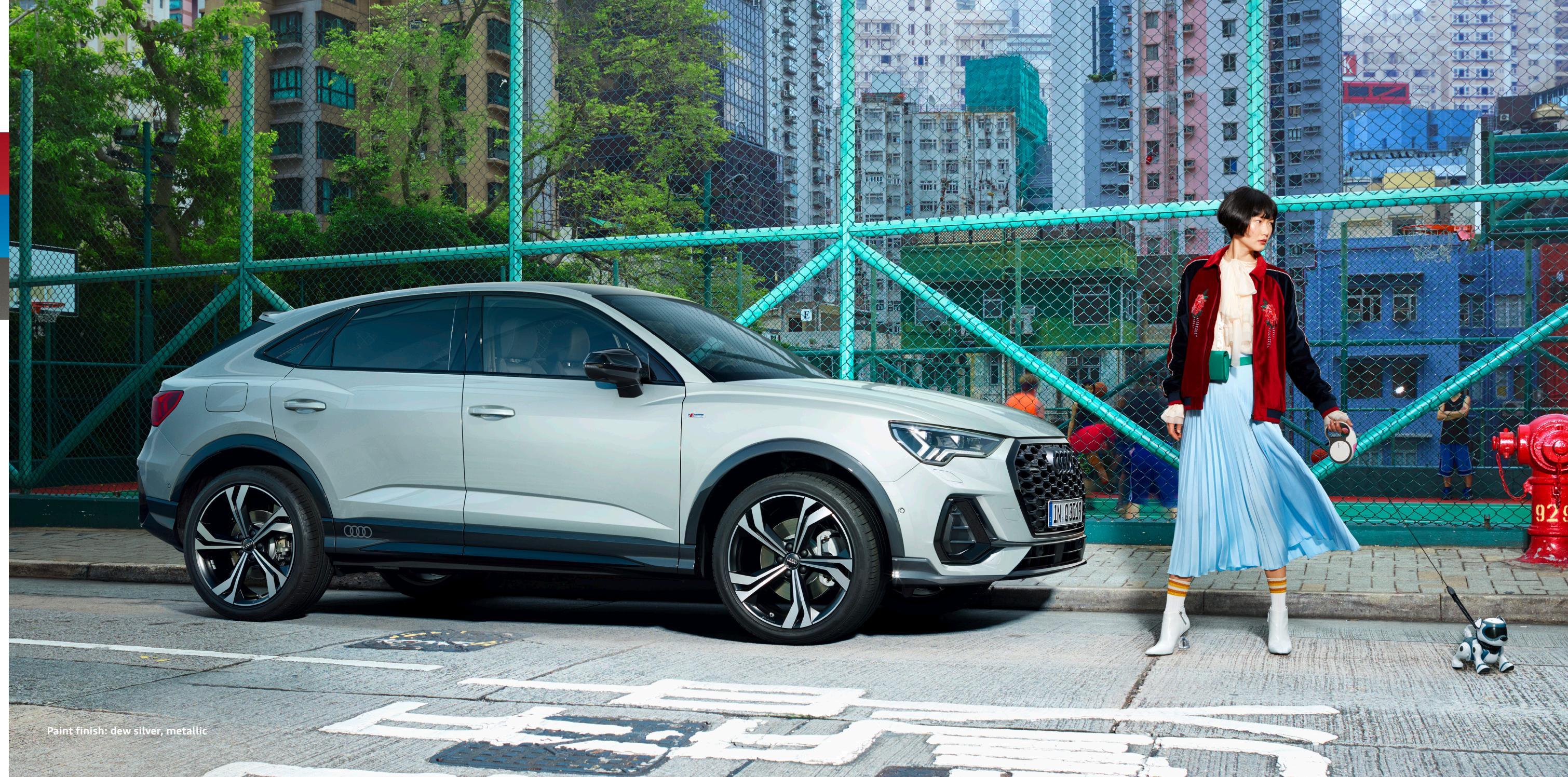
Paint finish: dew silver, metallic