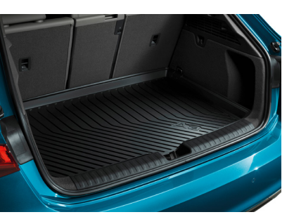
Luggage Compartment Liner