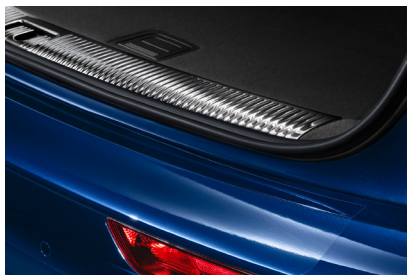
Loading Sill Protective Foil