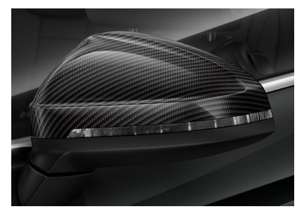
Door Mirror Housing Carbon