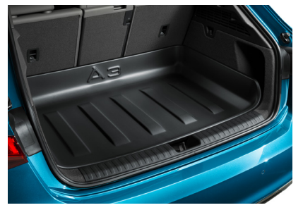
Rigid Load Liner