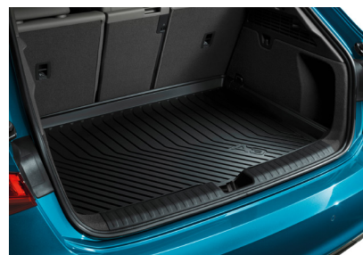
Luggage Compartment Liner