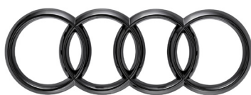
Black Badges and Rings