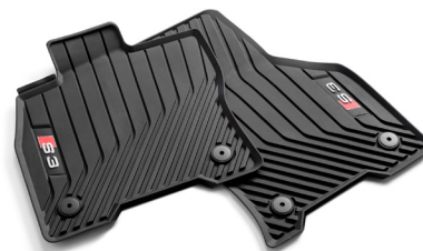
Sport Floor Mats