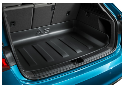
Rigid Load Liner