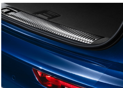
Loading Sill Protective Foil