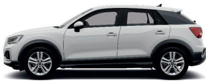
Arkona White Z9Z9 Solid €0