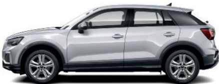
Floret Silver L5L5 2 Metallic €923