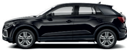
Brilliant Black A2A2 2 Solid €0