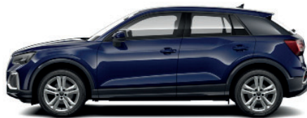
Navarra Blue 2D2D Metallic €923