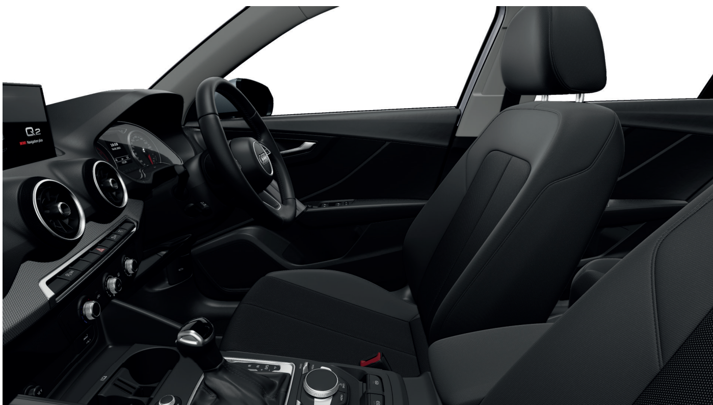
Black/Black Fabric Interior (Option Code YM)