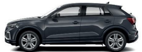
Manhattan Grey H1H1 2 Metallic €923