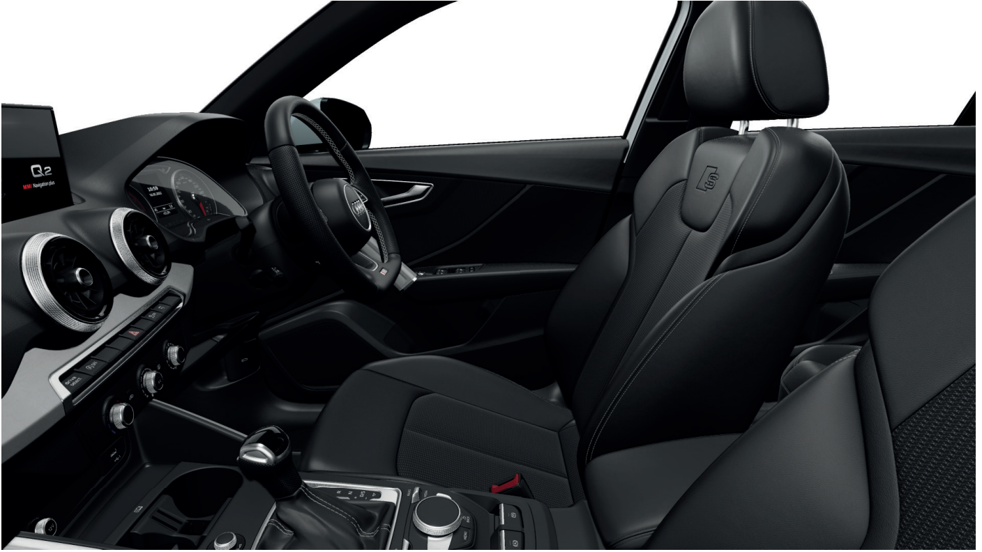
Black/Black Fabric “Pulse”/Leather Combination Interior (Option Code EI)