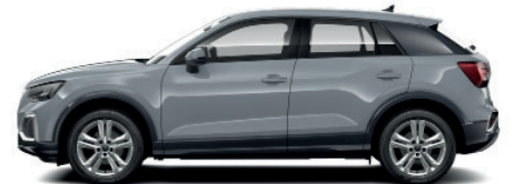
Arrow Grey 1X1X Pearl Effect €915