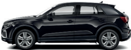
Mythos Black 0E0E Metallic €923