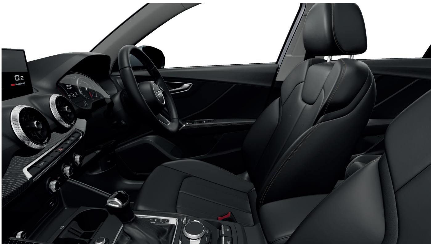
Black-Amaretto/Black Leather/Synthetic Leather Combination Interior (Option Code DO)