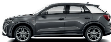
Daytona Grey 6Y6Y 1 Pearl Effect €930