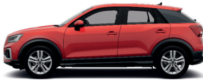
Progressive Red Y1Y1 Metallic €923