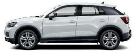
Glacier White 2Y2Y Metallic €923