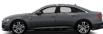
Daytona Grey 6Y6Y 2 Pearl Effect €1,496