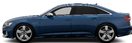
Ascari Blue 6I6I 2 Metallic €2,692