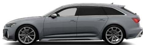
Nardo Grey T3T3 3 Solid €0