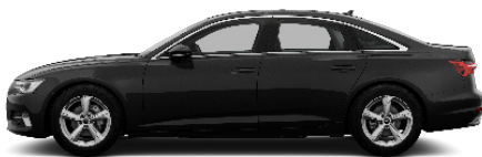
Manhattan Grey H1H1 1 Metallic €1,496