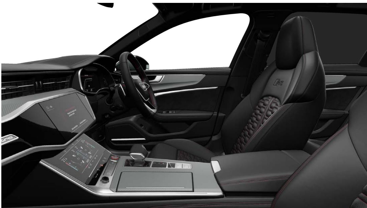
Black-Red/Black Leather Interior (Option Code AR)