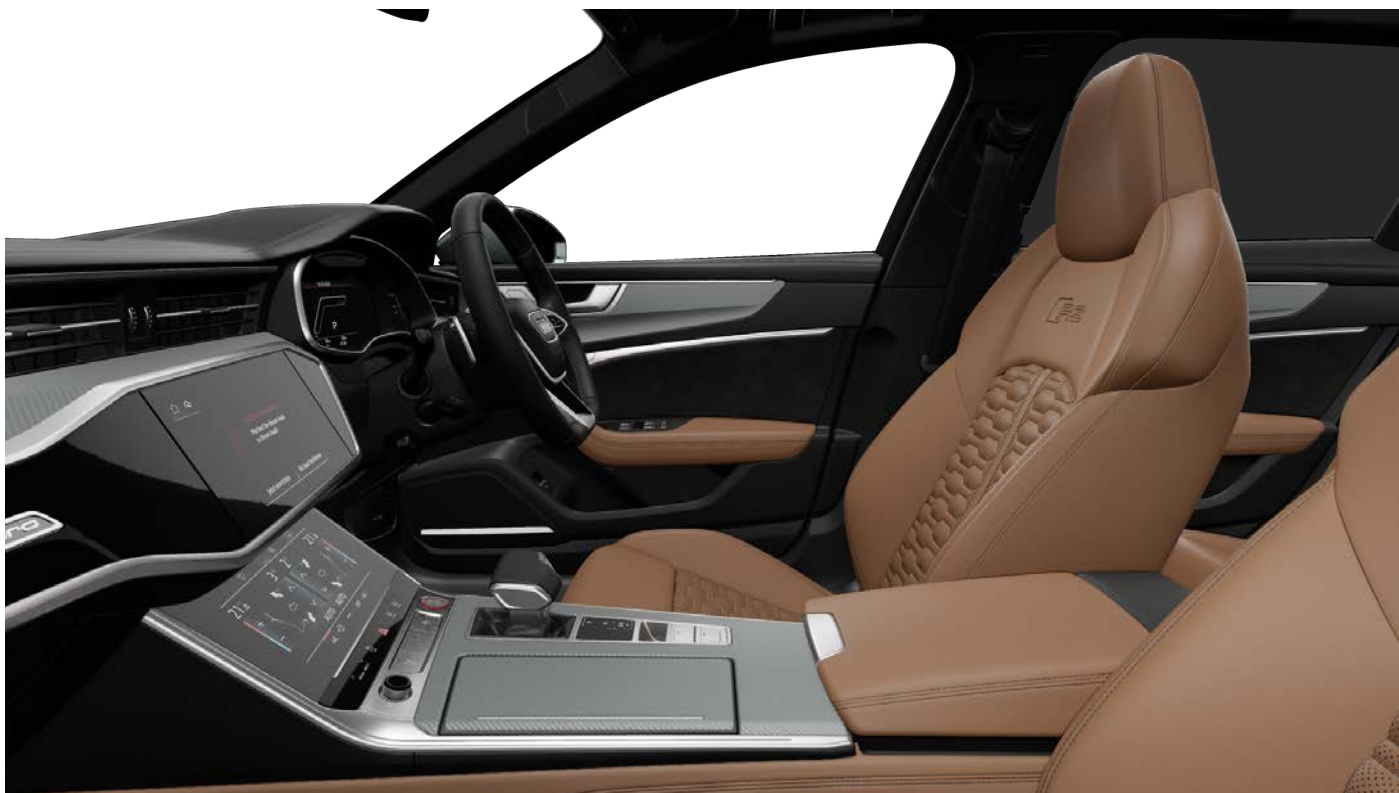
Cognac Brown-Granite Grey/Black Leather Interior (Option Code QN)