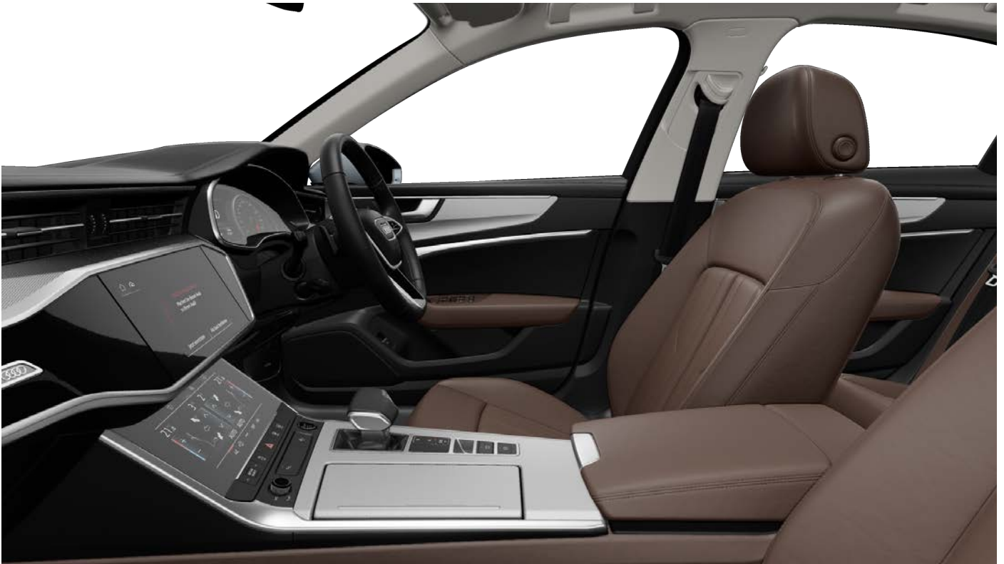
Okapi Brown/Black Leather Interior (Option Code ML)