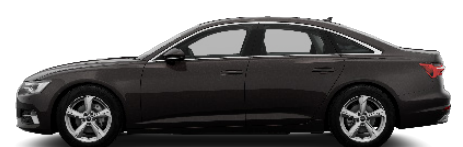
Firmament Brown 6Y6Y 2 Metallic €1,462