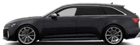
Sebring Black R5R5 3 Crystal Effect €3,083