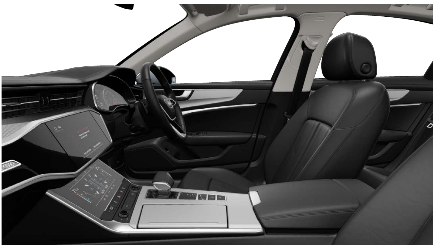
Black/Black Leather Interior (Option Code FZ)