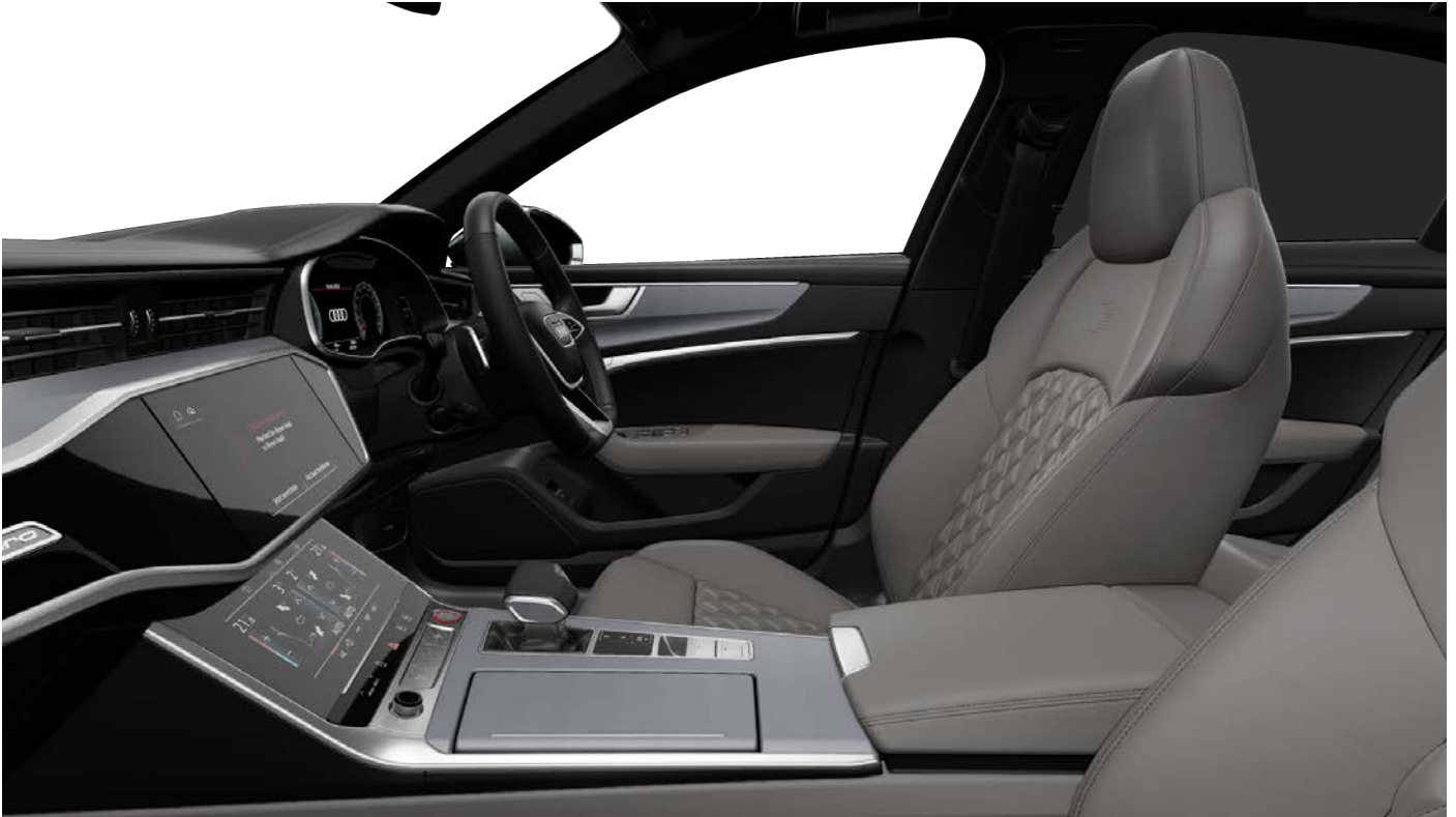
Rotor Grey/Black Leather Interior (Option Code TJ)