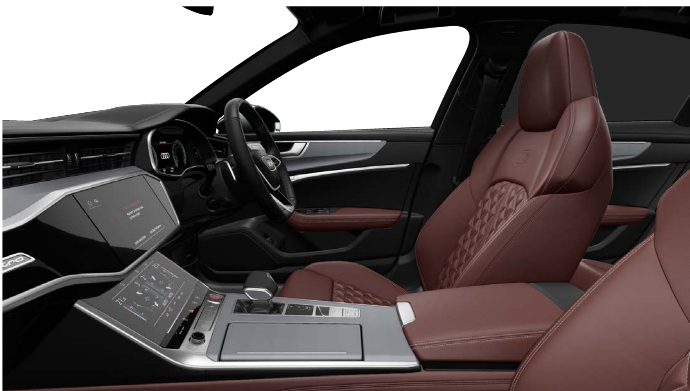
Red/Black Leather Interior (Option Code MD)