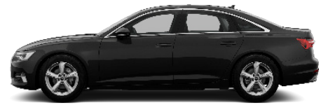
Mythos Black 0E0E Metallic €1,462