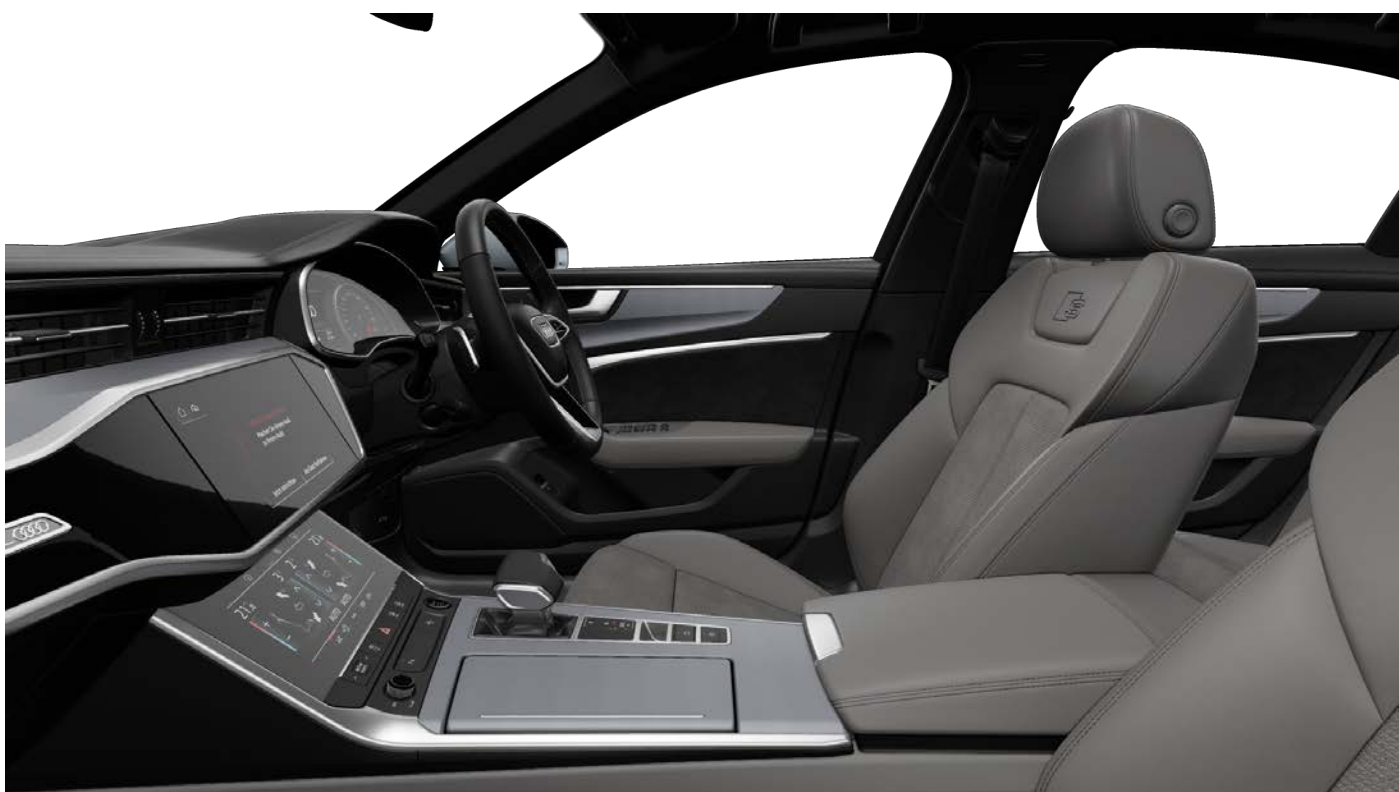
Rotor Grey/Black Dinamica® Microfiber “Frequenz”/Leather Interior (Option Code TJ)