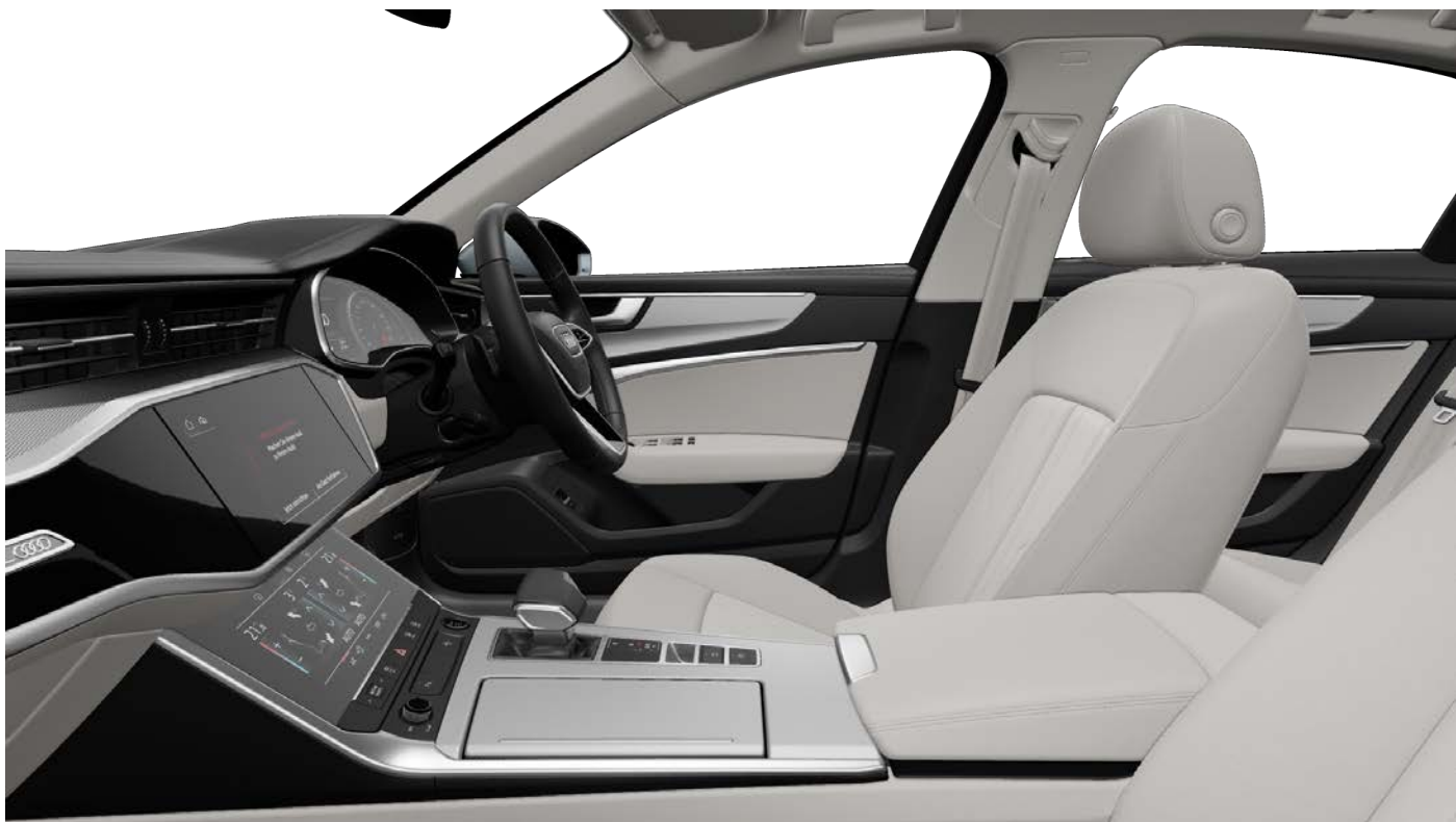
Beige/Black Beige Leather Interior (Option Code FN)