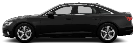
Brilliant Black A2A2 Solid €0