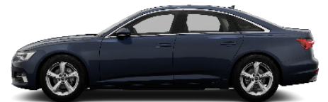
Firament Blue 5U5U Metallic €1,462