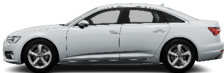
Glacier White 2Y2Y Metallic €1,462