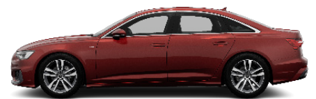
Grenadine Red Y1Y1 2 Metallic €1,496