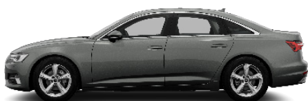
Chronos Grey Z7Z7 Metallic €1,462