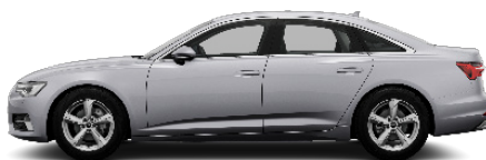
Floret Silver L5L5 Metallic €1,462