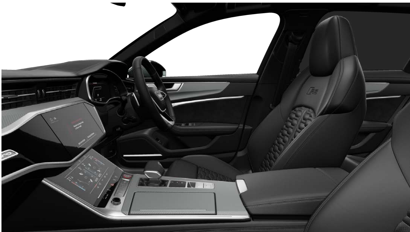
Black-Rock Grey/Black Leather Interior (Option Code UB)