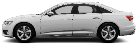
Arkona White T9T9 1 Solid €0