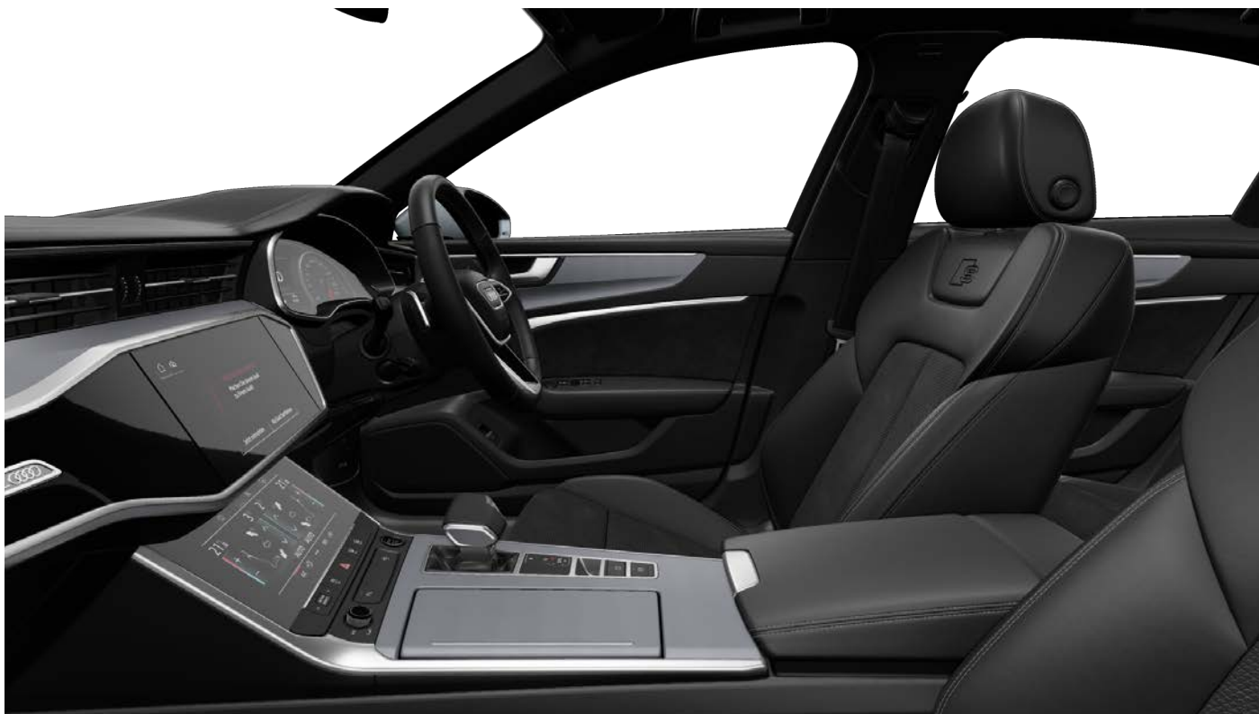
Black/Black Dinamica® Microfiber “Frequenz”/Leather Interior (Option Code MZ)