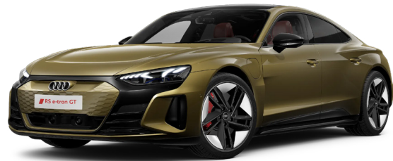
Tactics Green Metallic