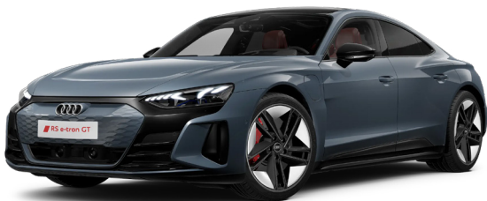
Kemora Gray Metallic