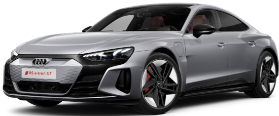
Floret Silver Metallic