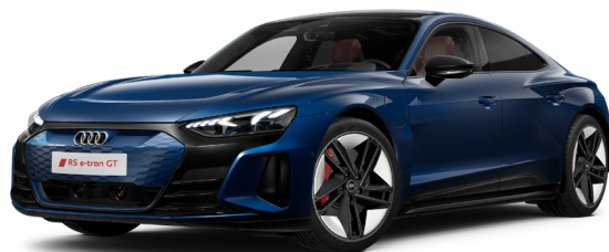
Ascari Blue Metallic