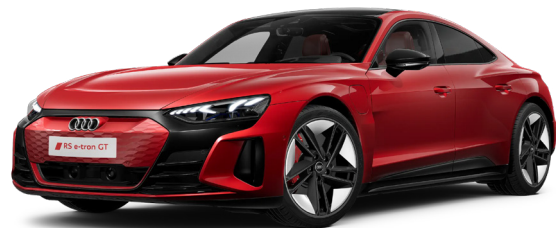
Tango Red Metallic