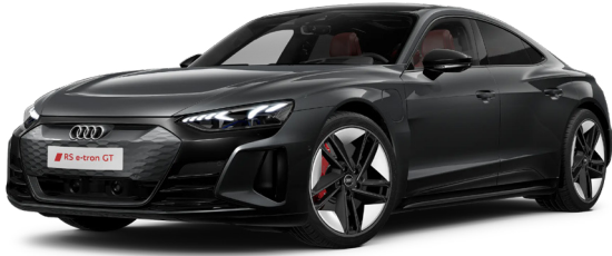
Daytona Gray Pearlescent