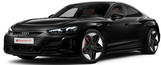
Myth Black Metallic