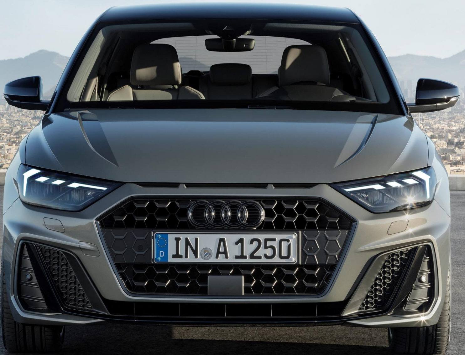
Image shows vehicle from the production year 2018 with optional equipment

* Audi A1 Sportback 25 TFSI, manual transmission, 70 kW: combined fuel consumption: 5.7 – 5.3 l/100 km; combined CO 2 -emissions: 129 - 120 g/km; CO 2 class: D