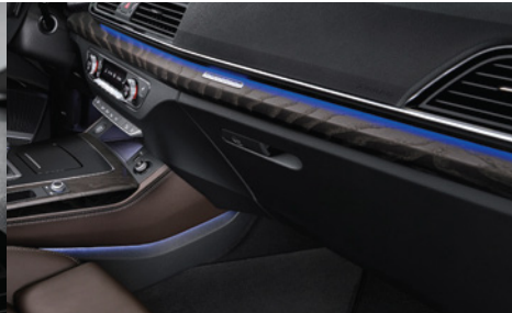
Ambient lighting package plus