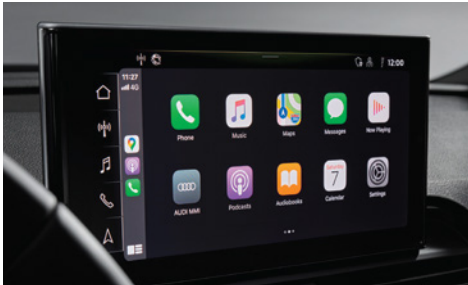
MMI touch display