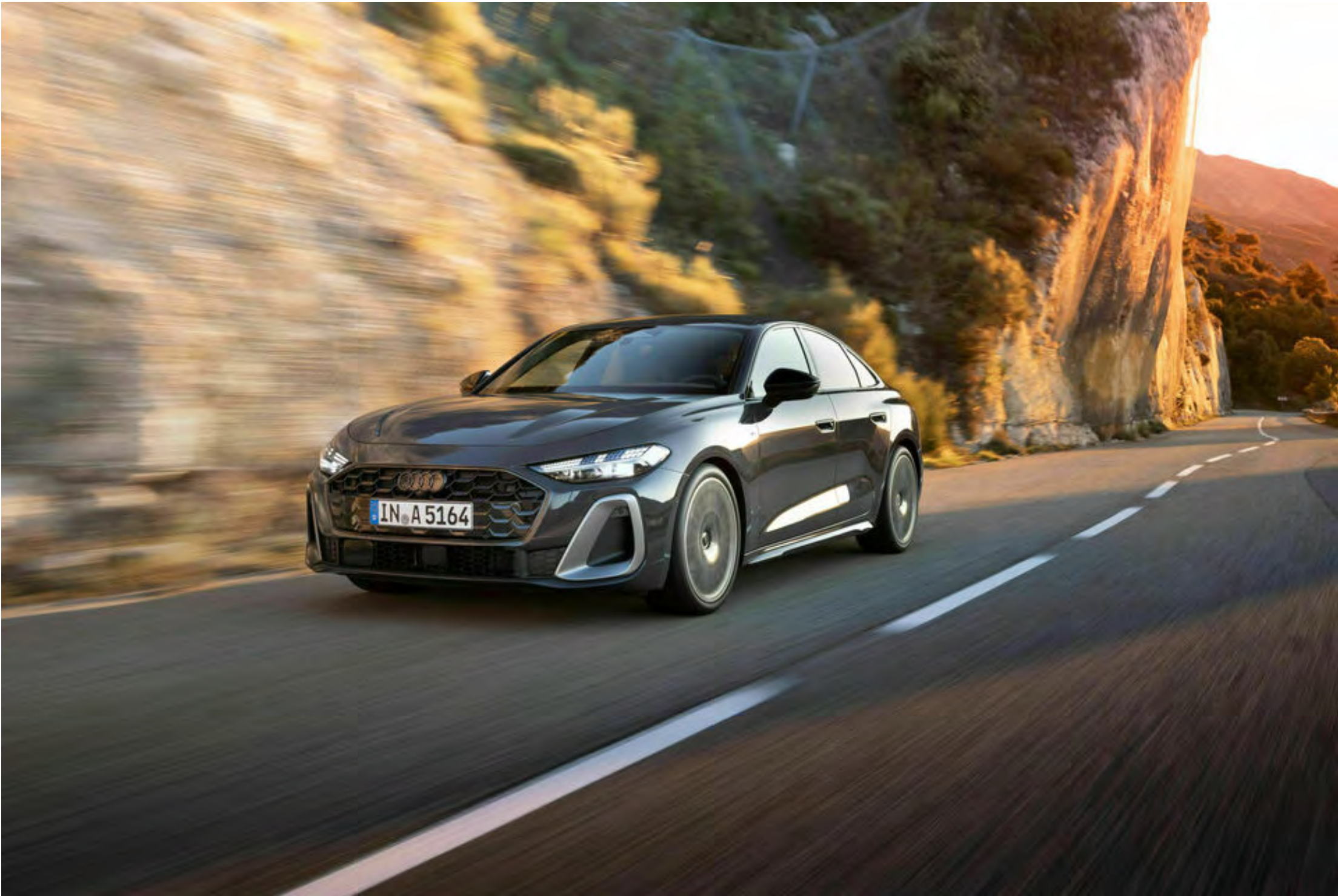
Information is accurate as at Dec 2024