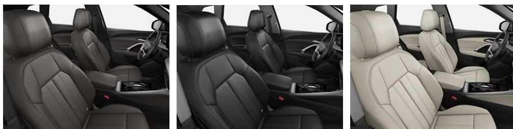
Leather combination seats in brown, black or beige.