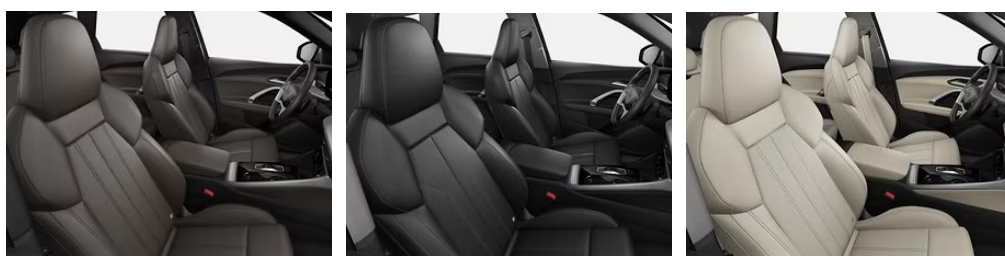
Sport seats with leather combination in brown, black or beige.