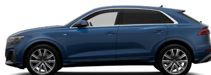
Ascari Blue Metallic 9W9W €3,467