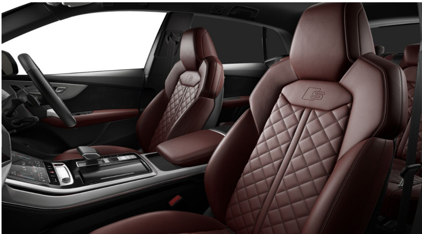
Arras Red/Black Leather Interior (Option Code XU)