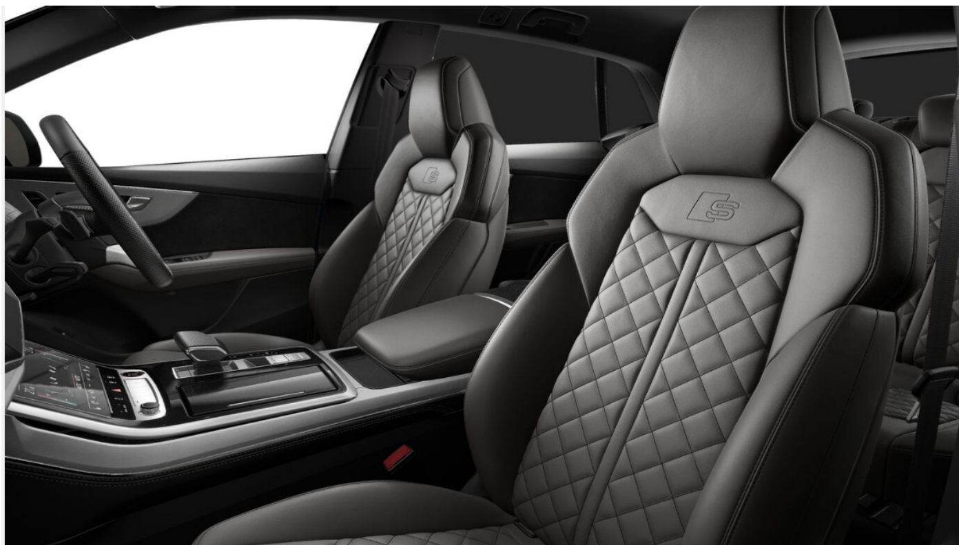
Rotor Grey/Black Leather Interior (Option Code OQ)