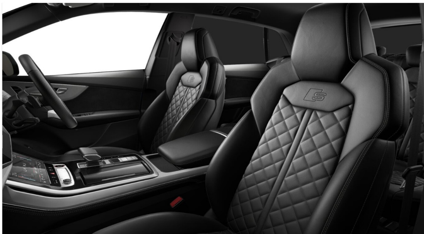
Black/Black Leather Interior (Option Code EI)