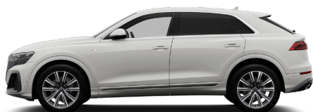
Pure White Solid 0Q0Q 1 €0