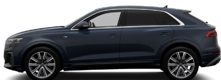
Waitomo Blue Metallic D6D6 €2,024