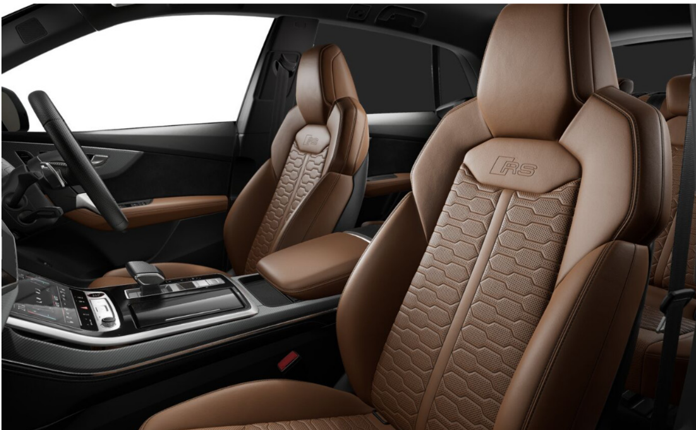
Cognac Brown-Granite Grey/Black Leather Interior (Option Code QN)