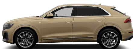
Sakhir Gold Metallic 2Z2Z €3,467