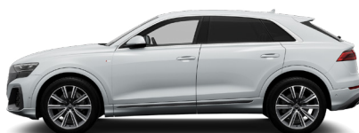
Glacier White Metallic 2Y2Y €2,024