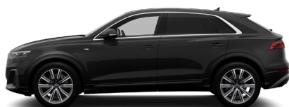
Mythos Black Metallic 0E0E €2,024