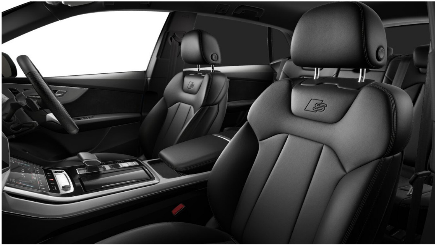
Black/Black Leather Interior (Option Code EI)