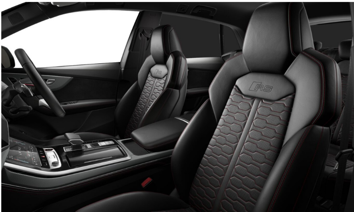
Black-Express Red/Black Leather Interior (Option Code AR)