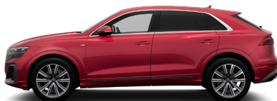
Chilli Red Metallic W0W0 €2,024