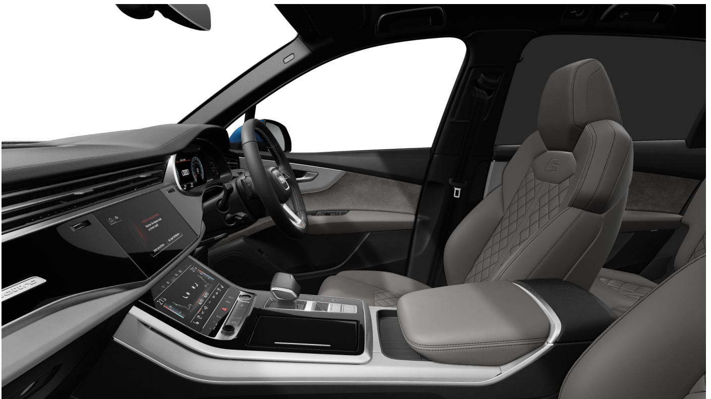
Rotor Grey/Black Leather Interior (Option Code OQ)