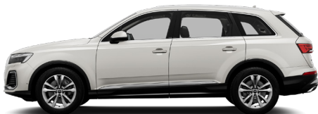
Vicuna Beige Metallic 5Q5Q 1 €1,348