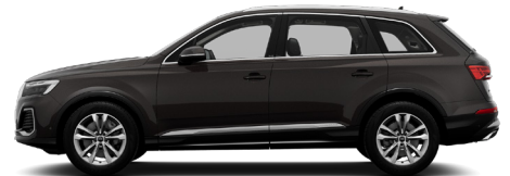
Tamarind Brown Metallic 3V3V 1 €1,348