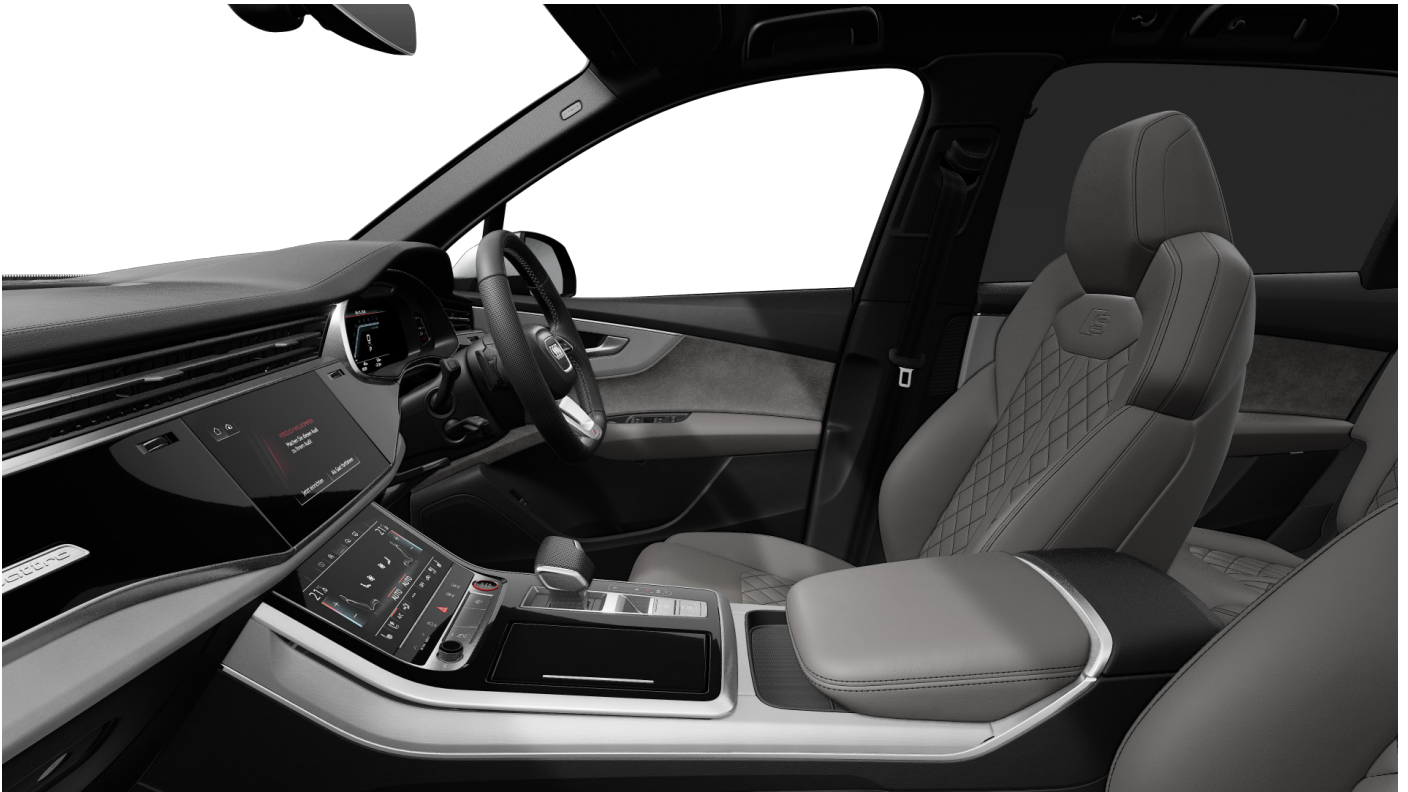
Rotor Grey/Black Leather Interior (Option Code OQ)