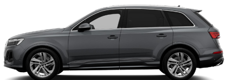
Daytona Grey Pearl Effect 6Y6Y 2 €1,348