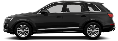
Mythos Black Metallic 0E0E €1,348