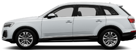
Glacier White Metallic 2Y2Y €1,348