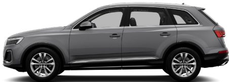
Samurai Grey Metallic 3M3M 1 €1,348