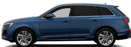
Ascari Blue Metallic 9W9W 2 €2,309