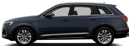
Waitomo Blue Metallic D6D6 €1,348