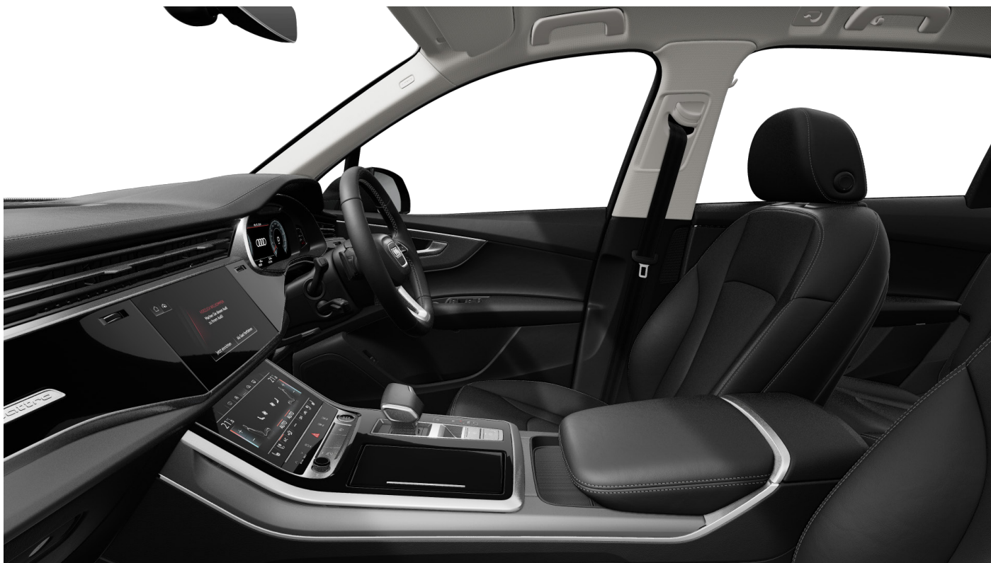
Black-Black-Rock Gray (Option Code MP)