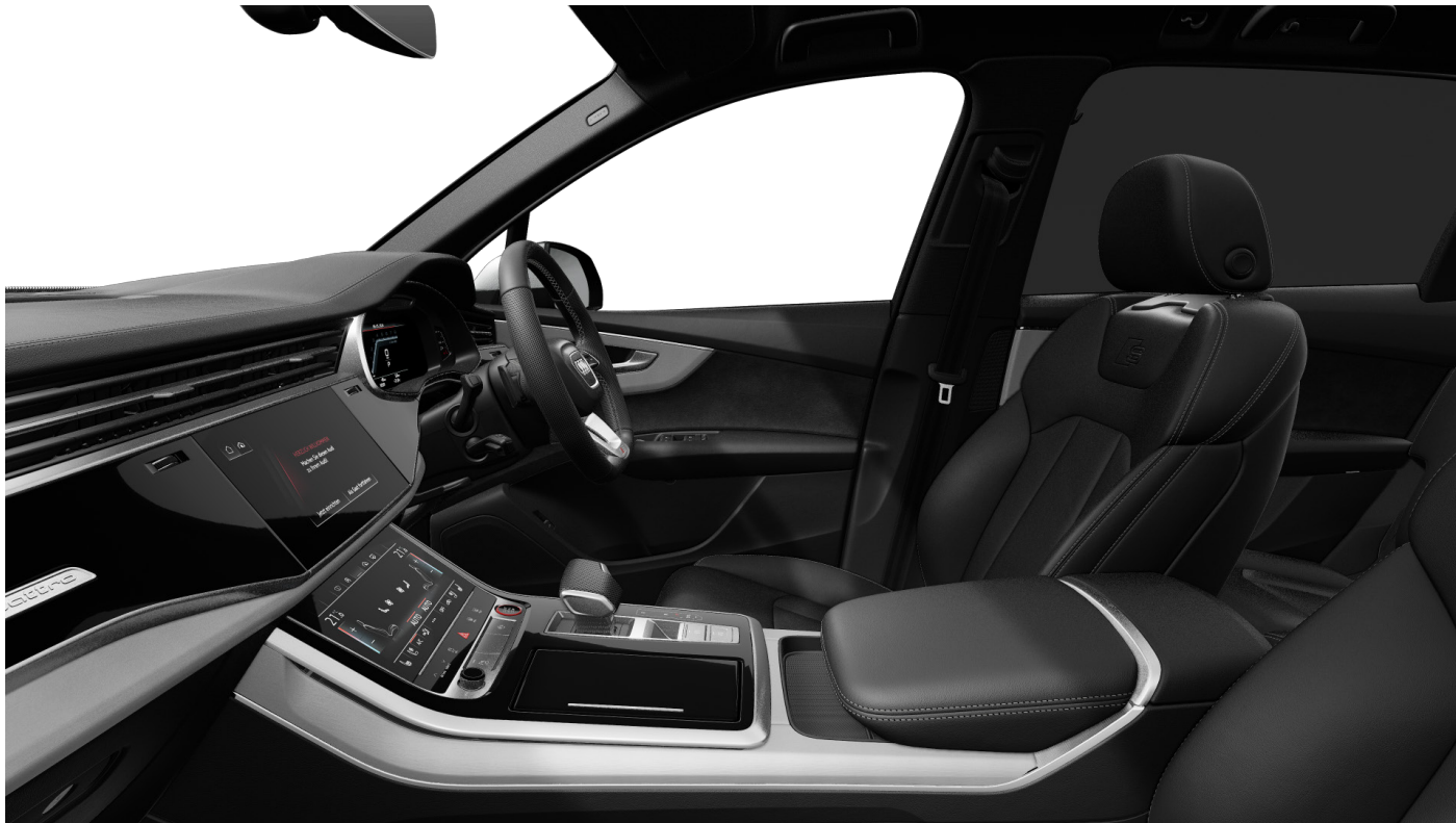
Black/Black Leather Interior (Option Code EI)