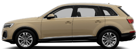
Sakhir Gold Metallic 2Z2Z €2,309