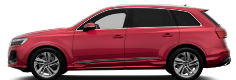
Chili Red Metallic T7T7 2 €1,348