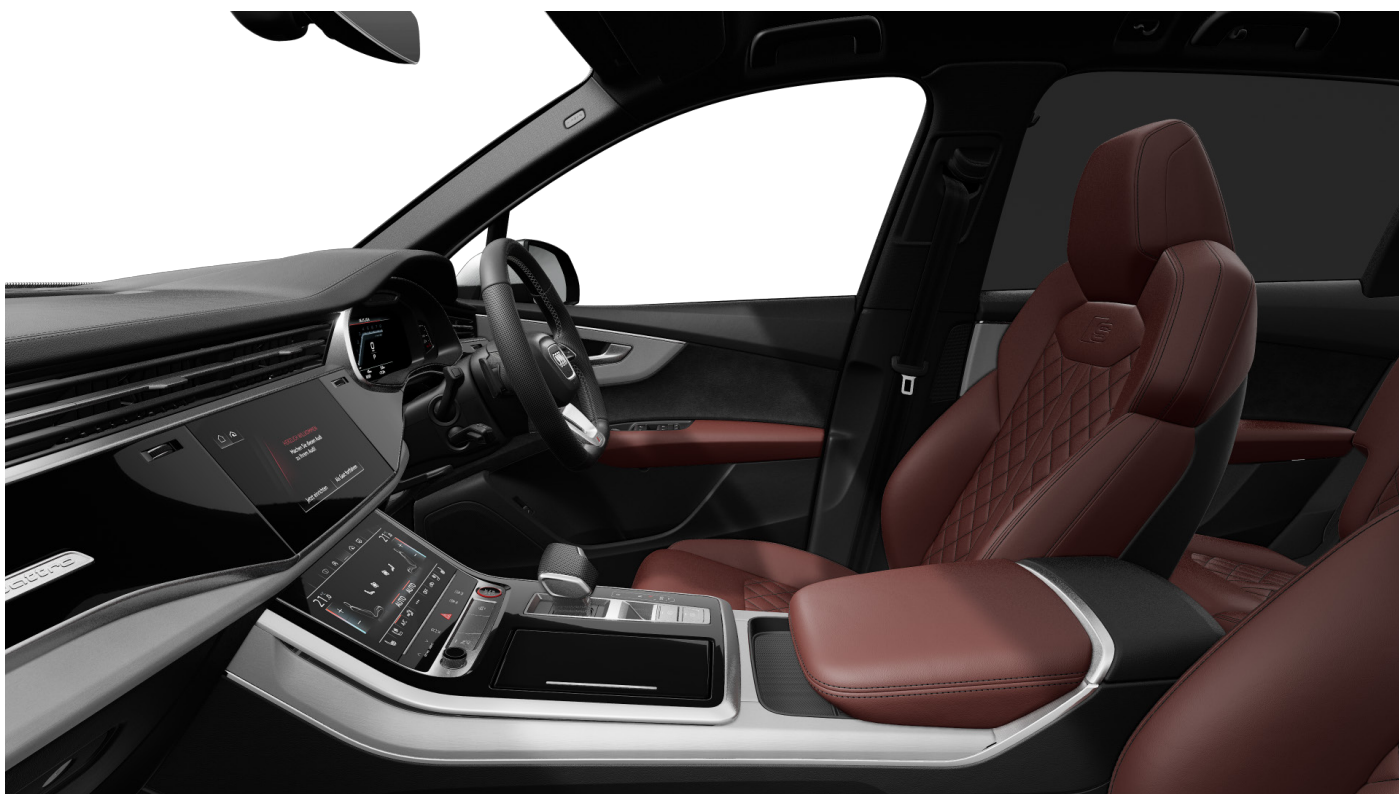
Arras Red/Black Leather Interior (Option Code XU)