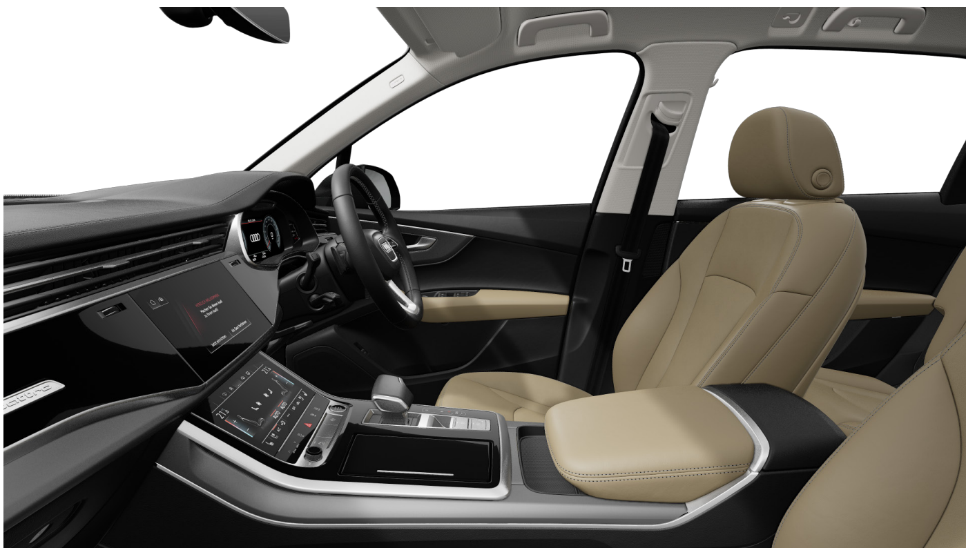
Saiga Beige-Saiga Beige-Steel Gray (Option Code RJ)