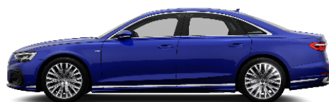
Ultra Blue 6I6I 1 Metallic €1,964