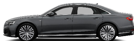
Daytona Grey 6Y6Y 1 Pearl Effect €1,964