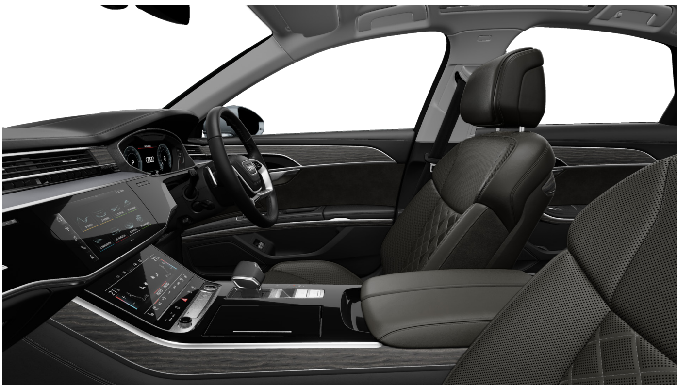
Goa Beige/Black Leather Interior (Option Code WX)