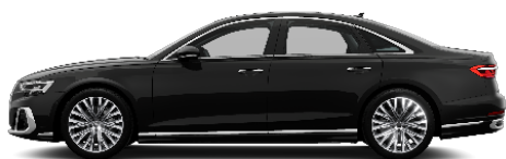
Brilliant Black A2A2 Solid €0