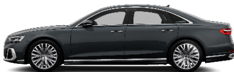
Manhattan Grey H1H1 Metallic €1,964