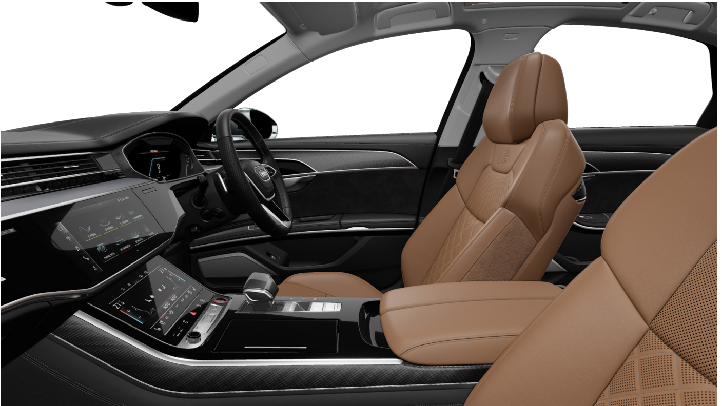
Cognac Brown-Steel Grey/Black Leather Interior (Option Code WZ)