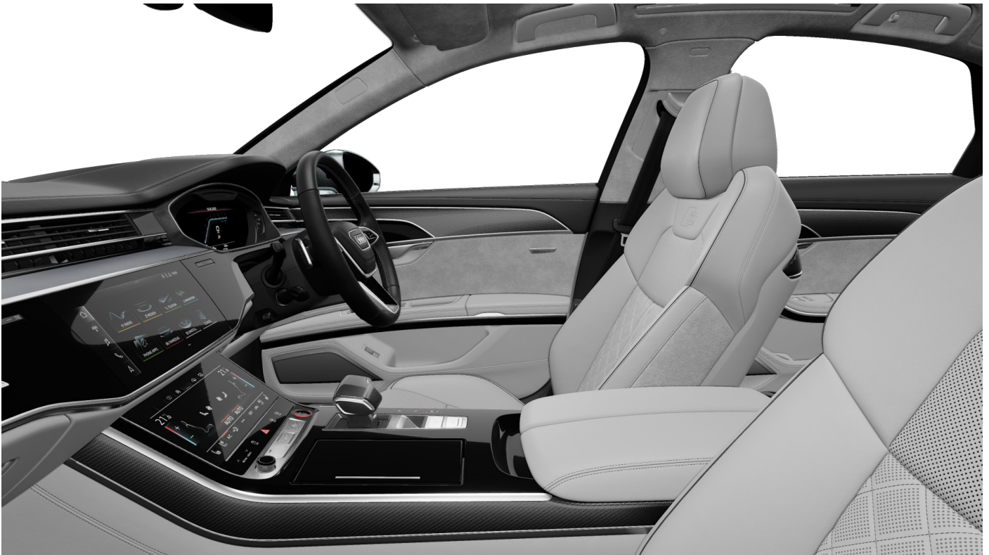
Pastel Silver/Granite Grey Leather Interior (Option Code YC)