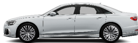
Glacier White 2Y2Y Metallic €1,964