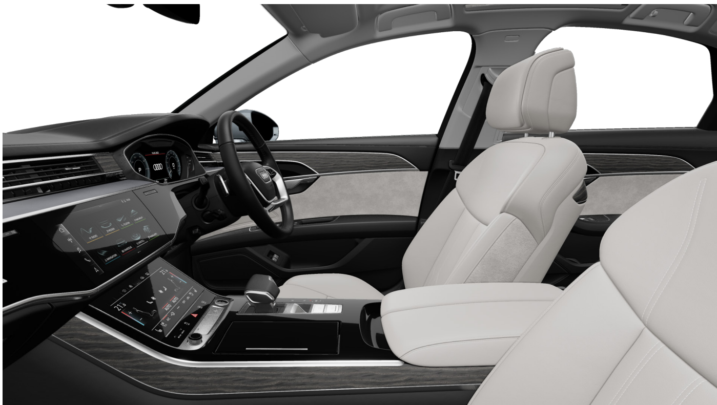
Beige/Black Leather Interior (Option Code WN)