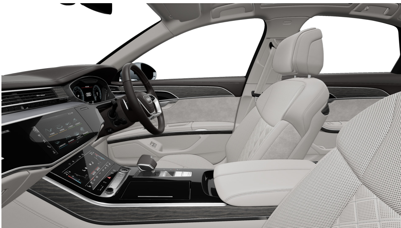
Brown/Brown-Pearl Leather Interior (Option Code WT)