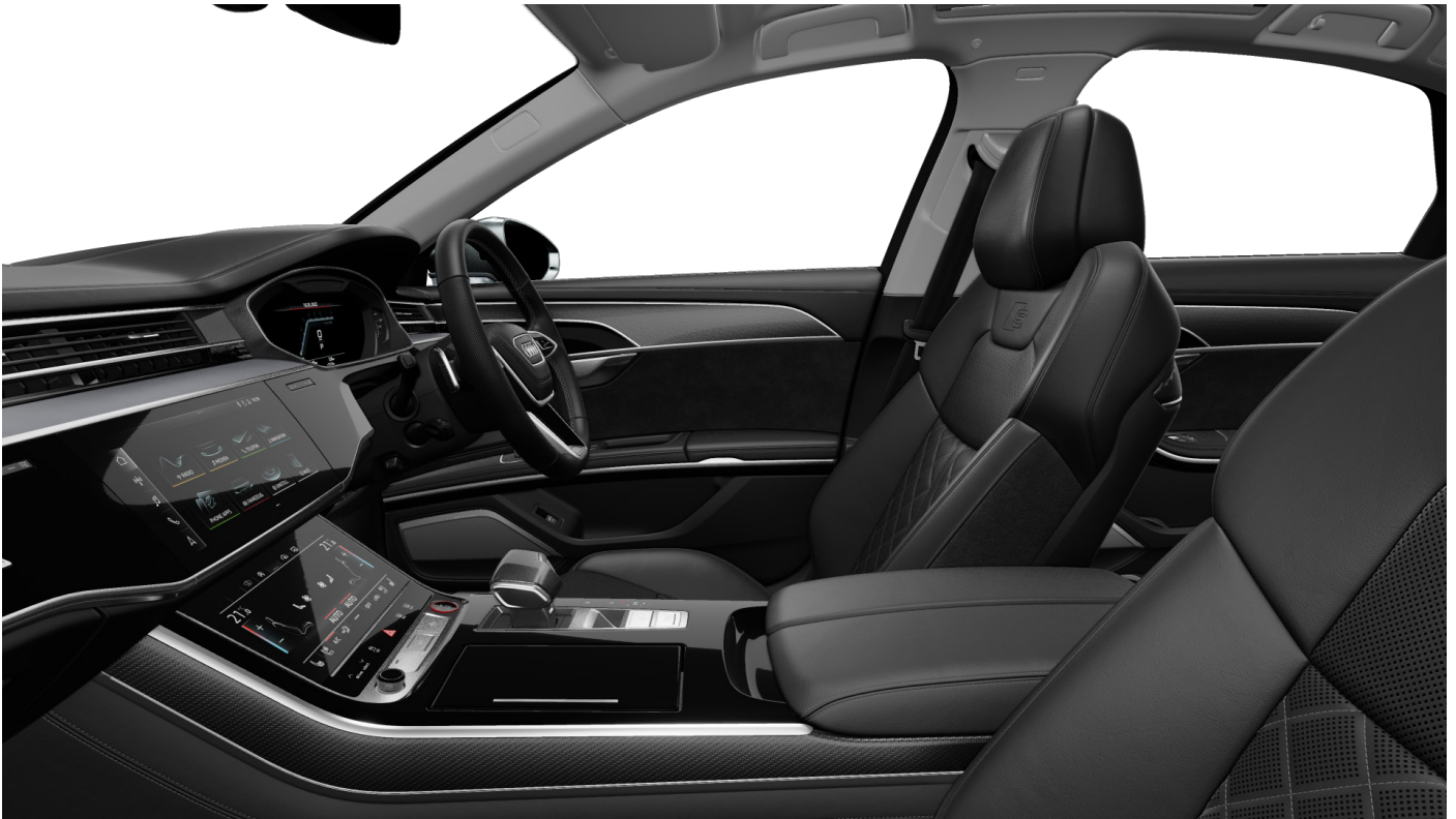
Black-Steel Grey/Black Leather Interior (Option Code WW)