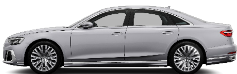
Floret Silver L5L5 Metallic €1,964