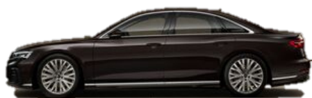
Maderia Brown 9E9E 1 Metallic €1,964