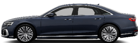
Firament Blue 5U5U Metallic €1,964