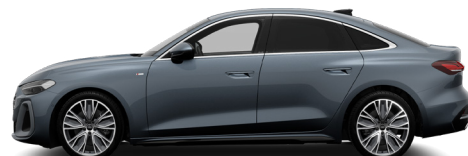
Horizon Blue H3H3 Metallic €1,192