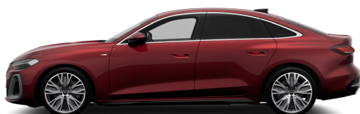
Grenadine Red S5S5 Metallic €1,192