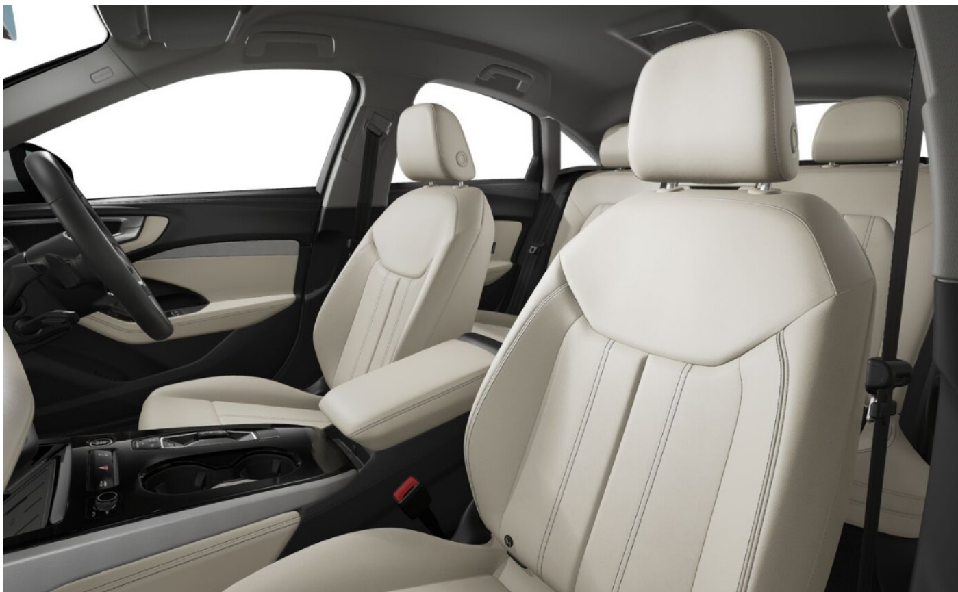
Leather/artificial leather combination, Beige (Option Code II)