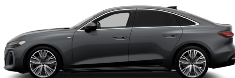
Daytona Grey 6Y6Y 1 Pearl €1,192