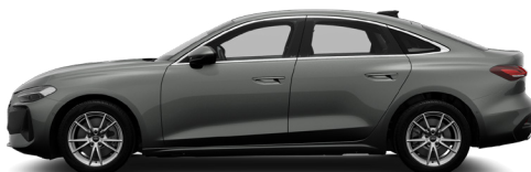
Chronos Grey Z7Z7 2 Metallic €1,192