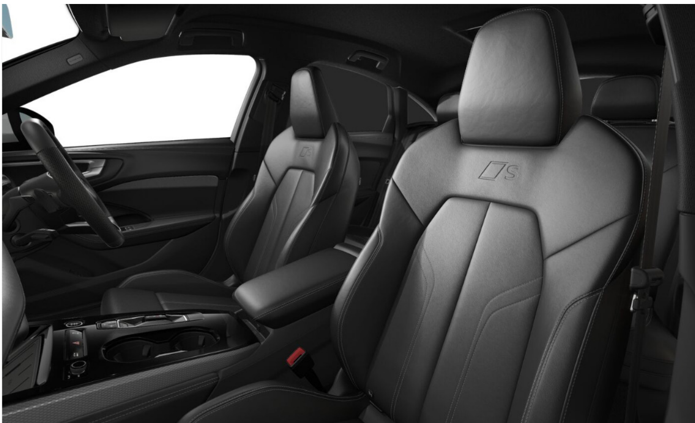
Interior S with sport seats in leather/artificial leather combination, Black (Code GX)