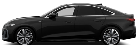
Mythos Black 0E0E Metallic €1,192