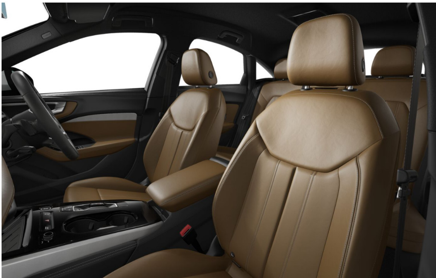
Leather/artificial leather combination, Brown (Option Code IP)