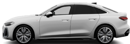
Arkona White Z9Z9 Solid €0