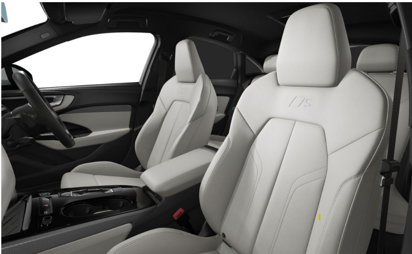
Interior S with sport seats in leather/artificial leather combination, Gray (Code OF)