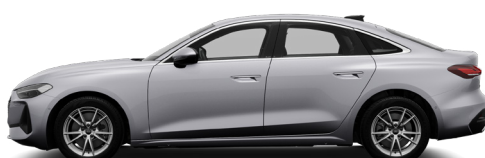
Floret Silver L5L5 2 Metallic €1,192