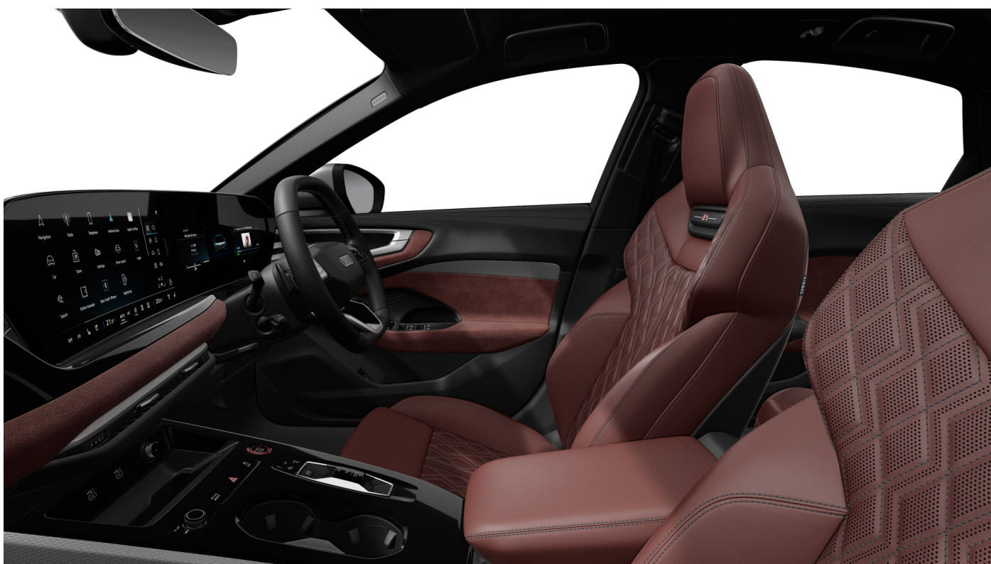
Interior S with sport seats plus in leather, Red (Code OR)