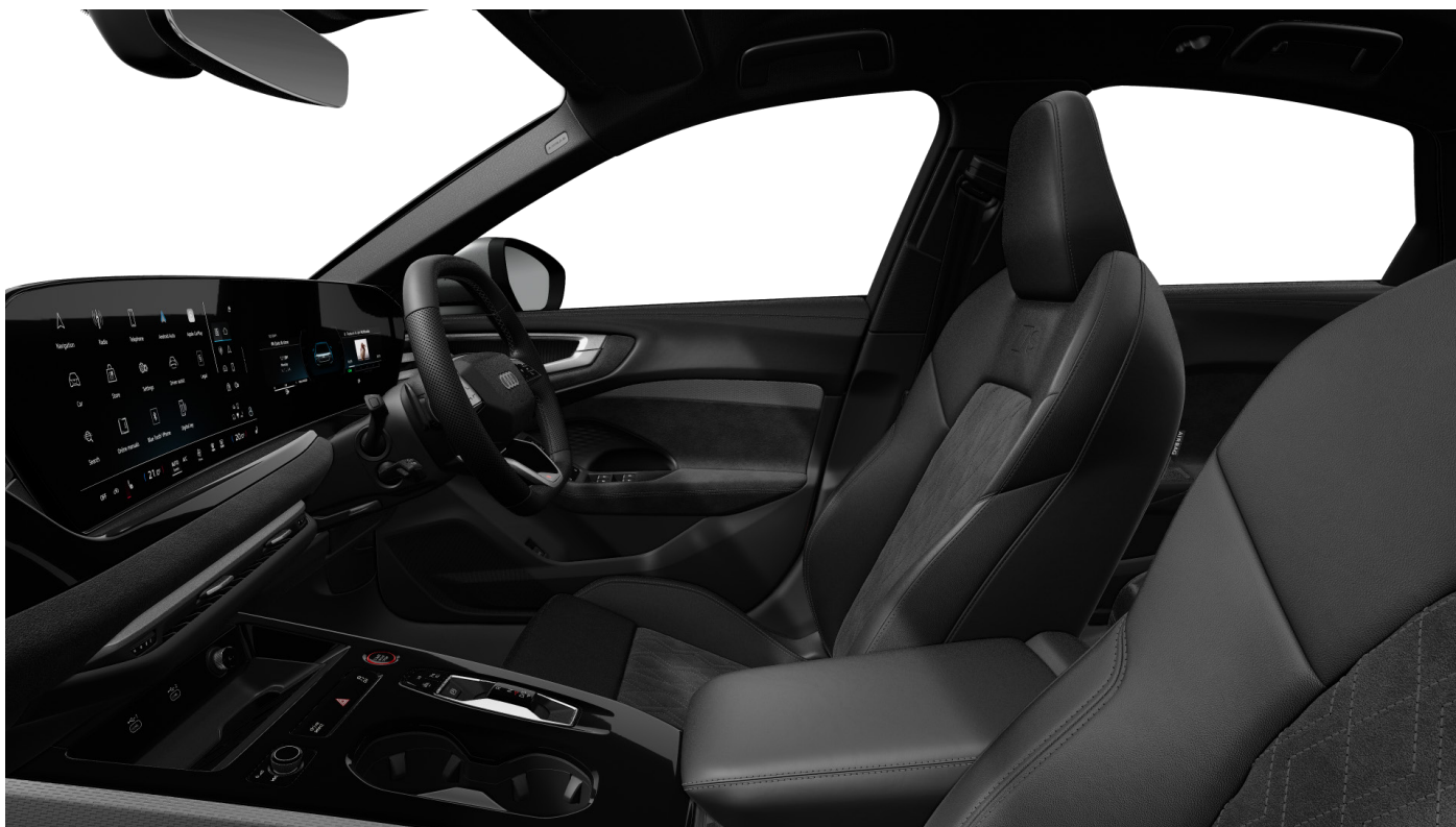
Interior S with sport seats in leather/artificial leather combination, Black (Code GX)