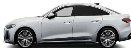
Glacier White 2Y2Y Metallic €1,192