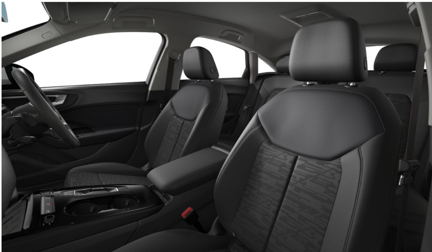
Cloth (Option Code MI)