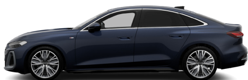
Firmament Blue 5U5U Metallic €1,192