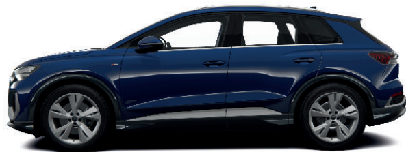
Navarra Blue 2D2D Metallic €0