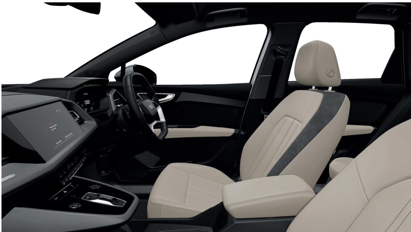
Beige/Black Leather/Artificial Leather Combination Interior (Option Code BH)