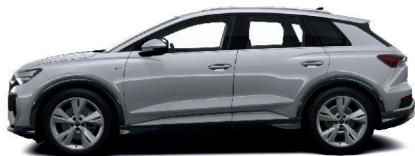
Floret Silver L5L5 Metallic €0