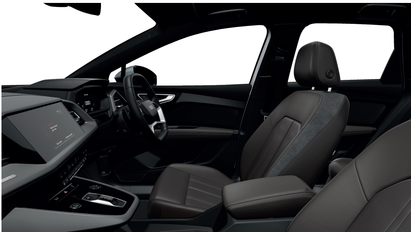
Brown/Black Leather/Artificial Leather Combination Interior (Option Code FX)