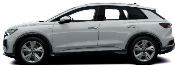
Glacier White 2Y2Y Metallic €0