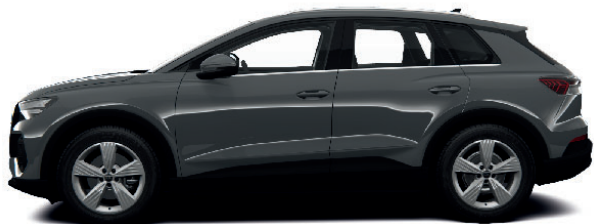
Pebble Grey C2C2 Solid €0