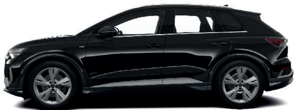
Mythos Black 0E0E Metallic €0