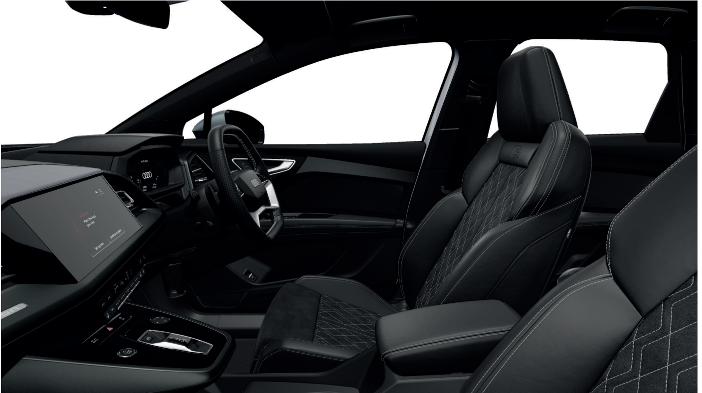
Black-Rock Grey/Black “Pulse” Cloth/Leatherette Interior (Option Code EI)