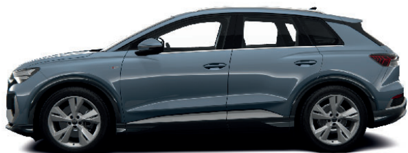
Geyser Blue 5Y5Y Metallic €0