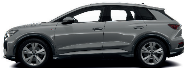
Typhoon Grey 2L2L Metallic €0

For more colour options please visit audi.ie